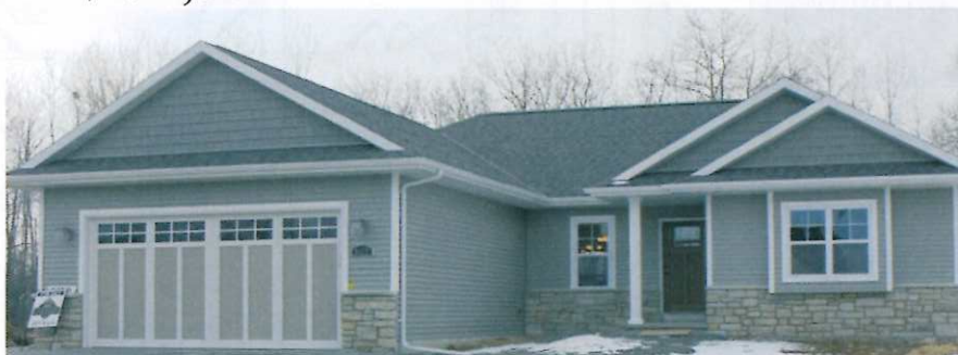
(Home similar to photo. This home has a 3 car garage)

Municipality: De Pere County: Brown Tax ID: ED-2790 School District: De Pere Zoning: Residential Lot Size: 80' x 163' Style: Ranch Exterior: Stone, Vinyl